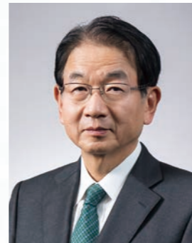
Representative Director, Chairman, President & CEO

We will update you on our progress as we meet new challenges.